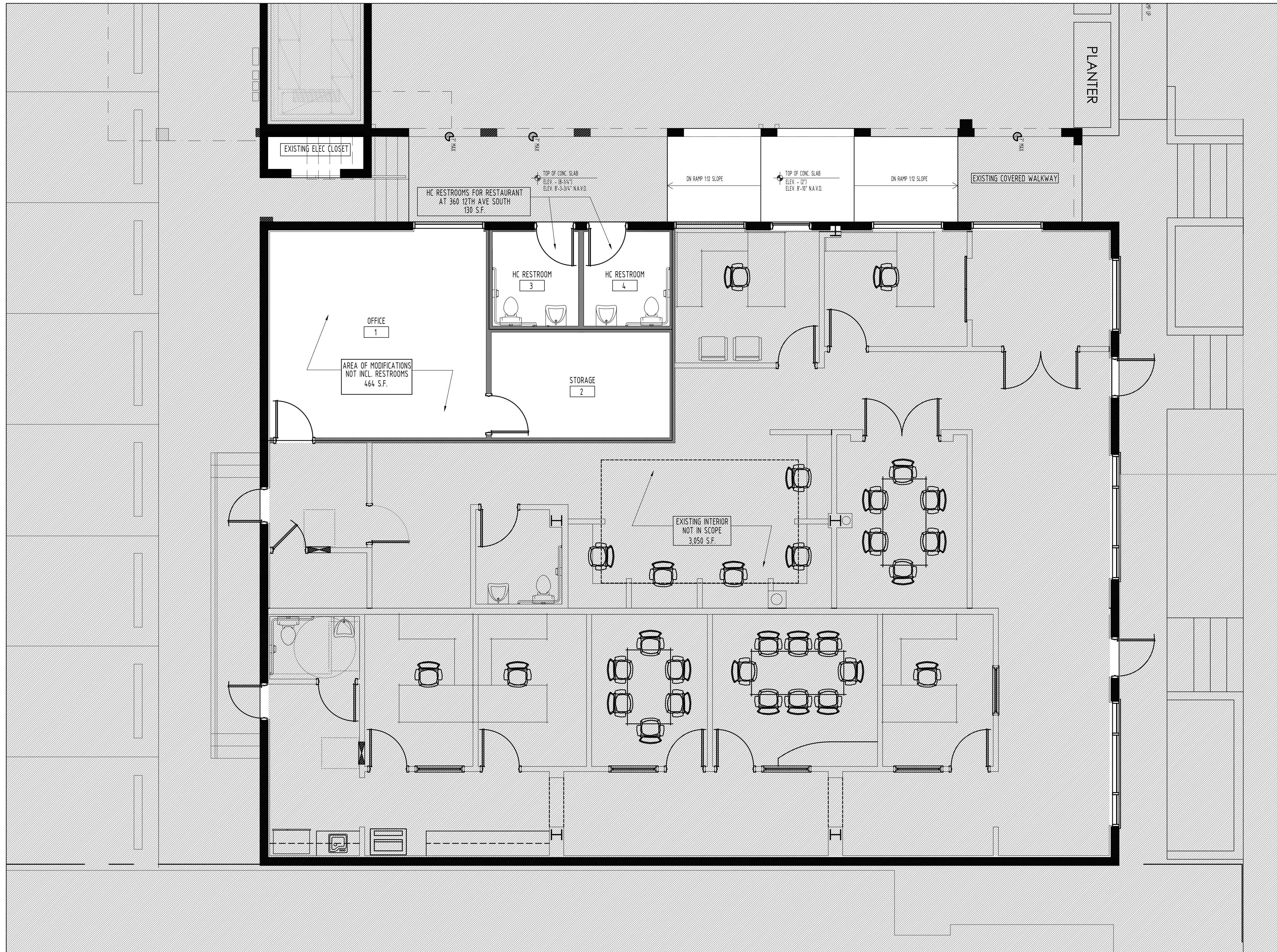
FLOOR PLAN SCALE : 1/4" = 1'-0"